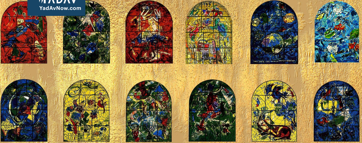
THE CHAGALL WINDOWS, HADASSAH MEDICAL CENTER